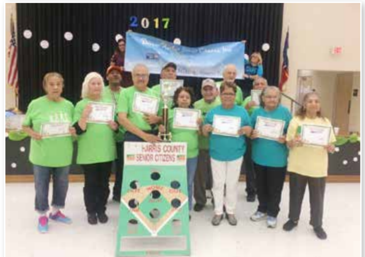
1st Place Grand Champions– Inner City Seniors

Shout out to all our participants for the Precinct2gether Ultimate Beanbag Playoffs. The winners of the North Channel, Inner City, South Channel and North by North Senior Olympics Bean Bag Baseball competition brought their winners to compete against each other for the 2017 playoffs trophy.